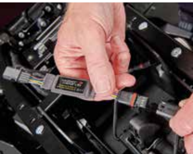
simply 'plug and play'