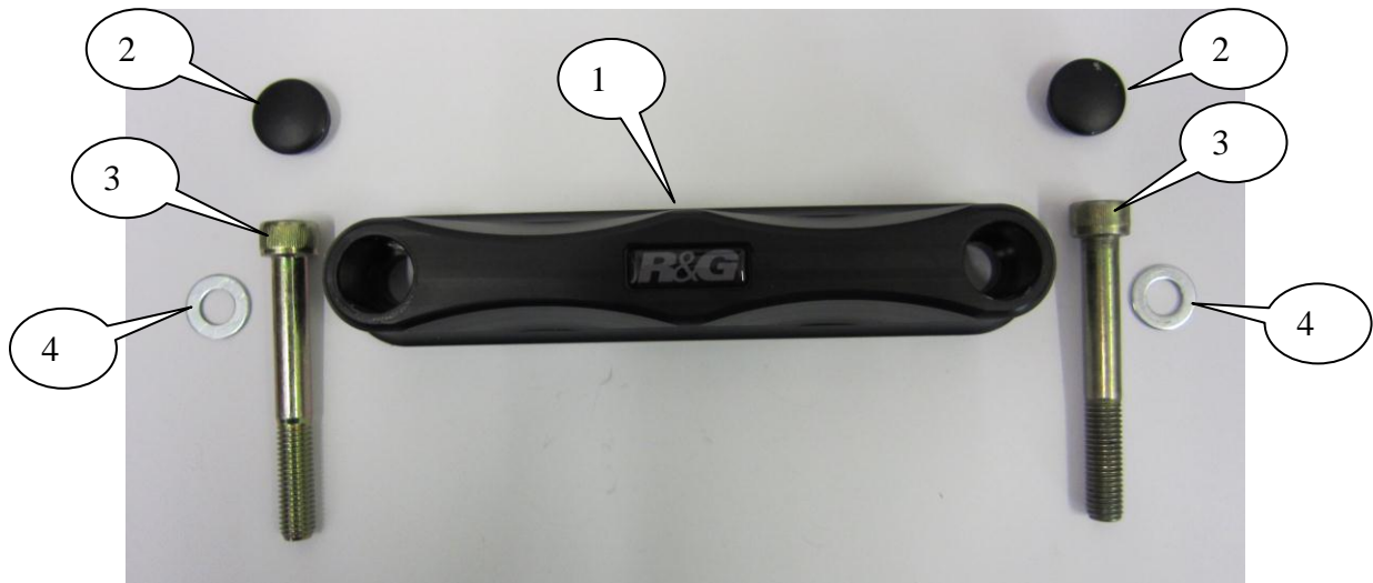
LEFT HAND SIDE

THE PARTS SHOWN MAY BE REPRESENTATIVE ONLY (FOR CLARITY OF INSTRUCTIONS ONLY)