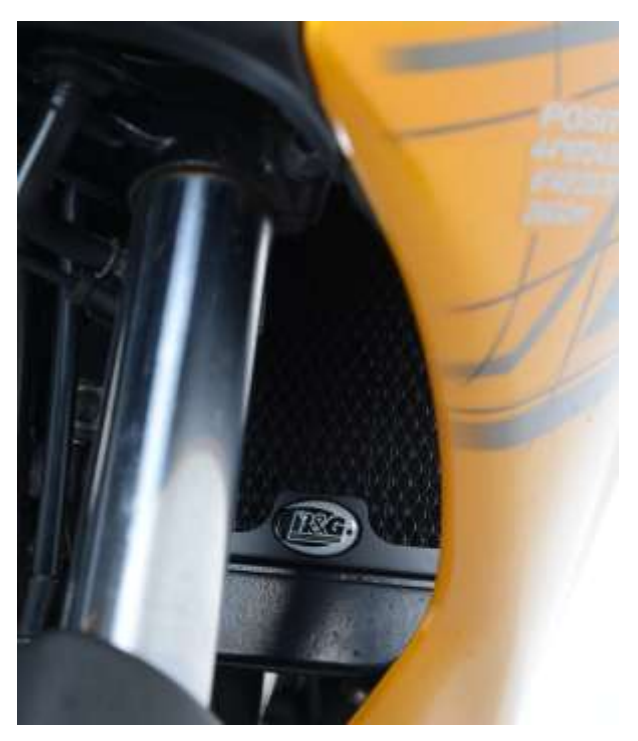
Le kit doit contenir : 2x Grille de protection (RAD0163BK gauche & droite) 2x 100mm Mousses autocollantes