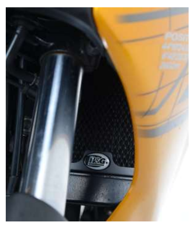
In This Kit There Should Be 2x Radiator Guard (RAD0163BK Left & Right) 2x 100mm Lengths of self-adhesive Foam