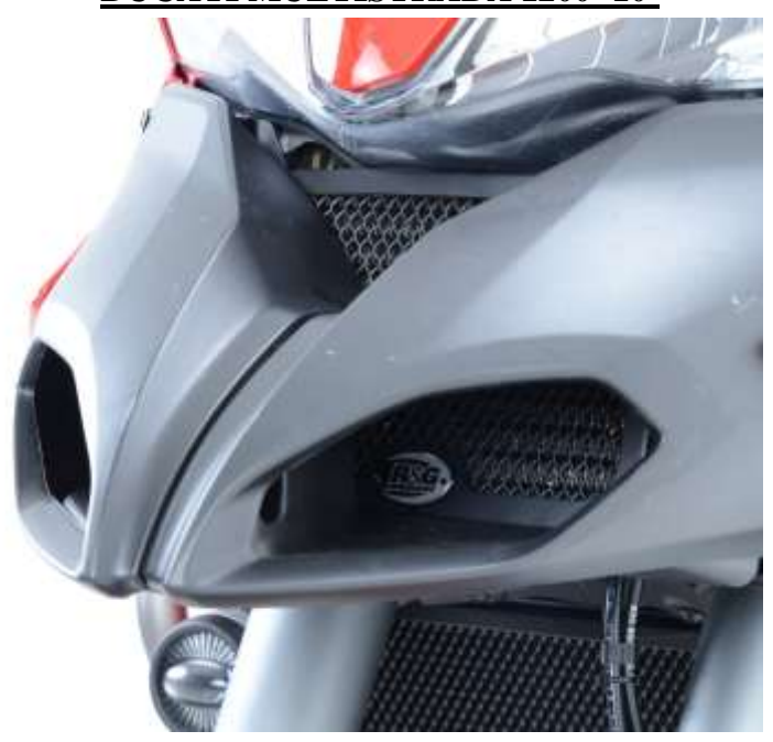
In This Kit There Should Be 1x Oil Cooler Guard (OCG0020) 2x 100mm Length of self-adhesive foam