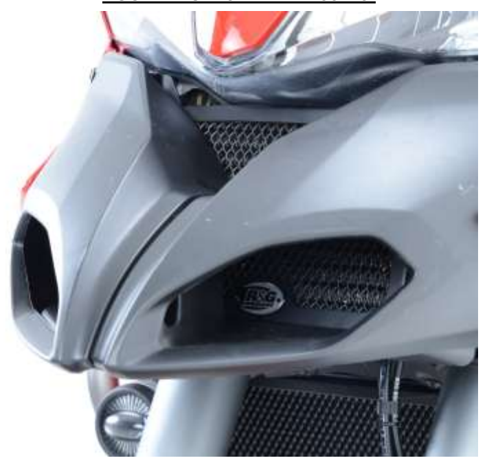
Le kit doit contenir : 1x Grille de protection (OCG0020) 2x 100mm Longueur de mousse autocollante